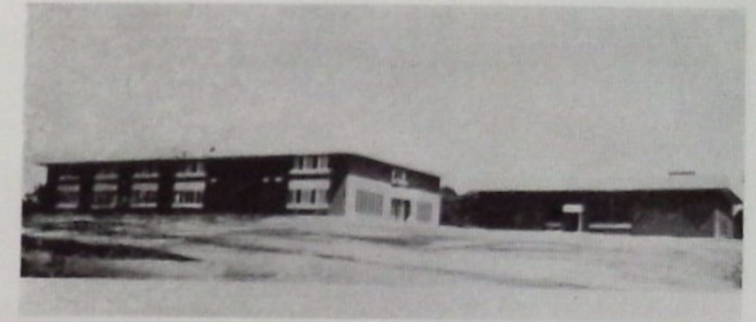
Academic - Administration and Library Buildings