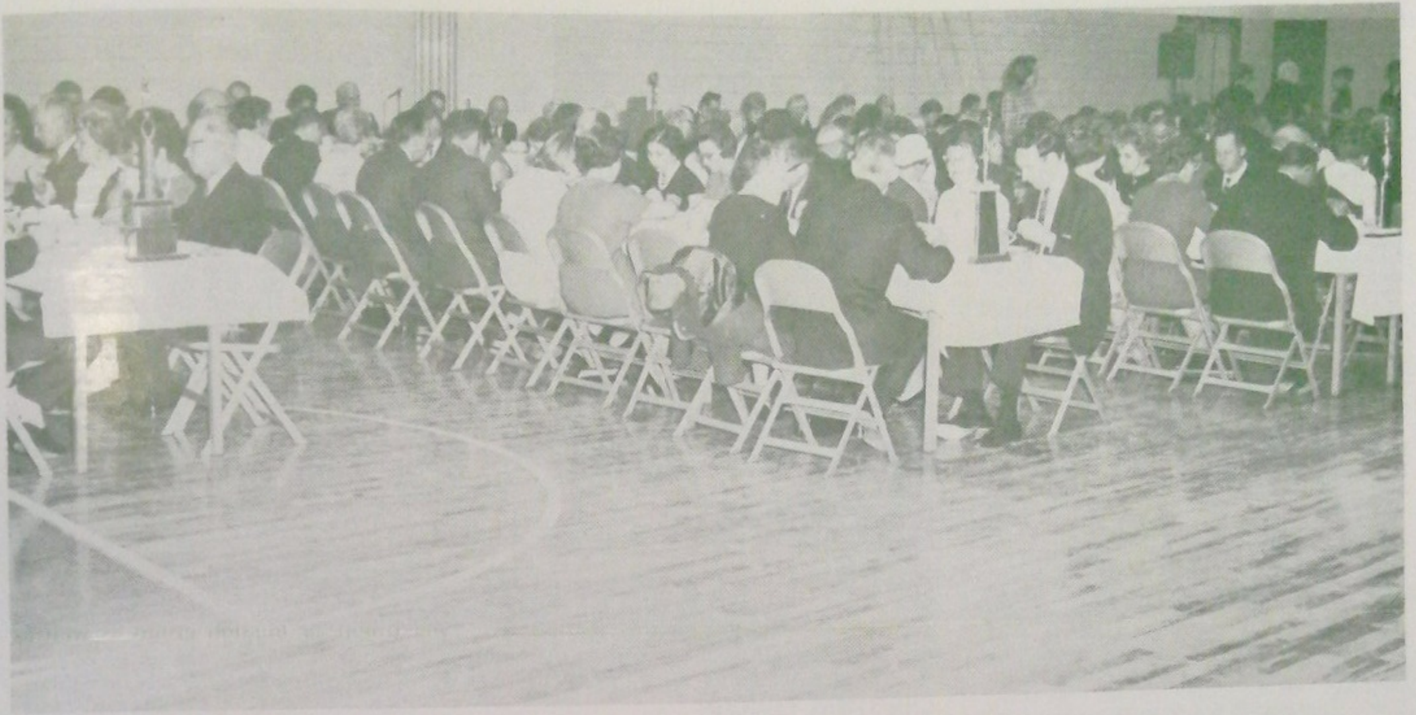
1968 Booster Banquet In New Gymnasium