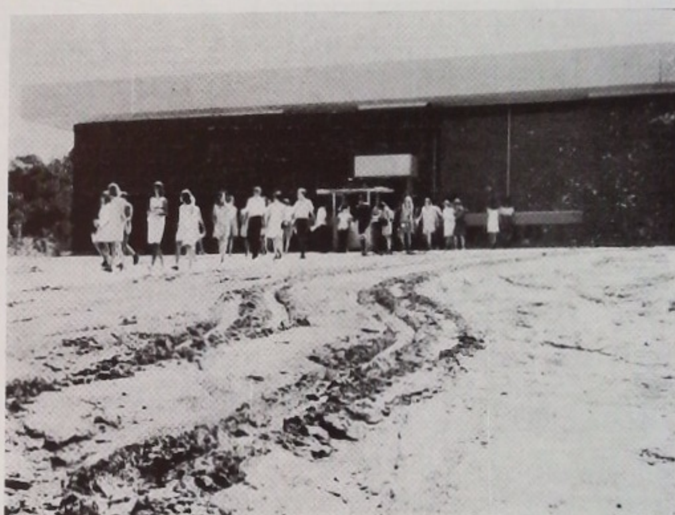
Tour Group Leaving the Library